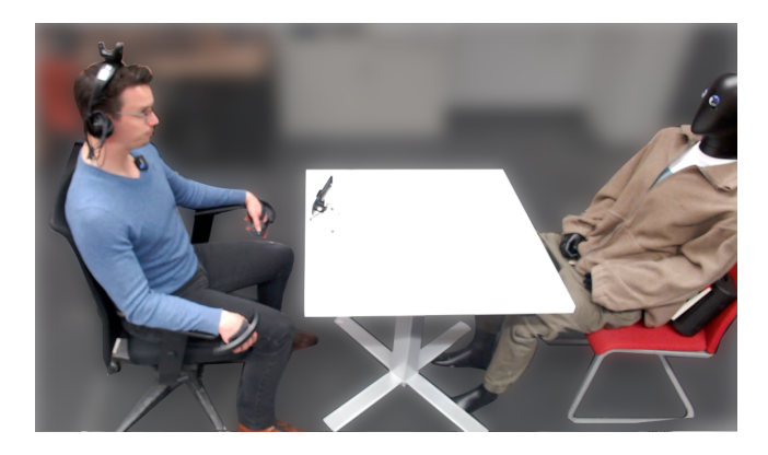
Figure 2: Performance capture setup . Actor facing a mannequin as target while equipped with head tracker, microphone, and hand controllers, with face tracker on table.

To initiate unscripted natural behavior, we examined a set of questions intended to be used in a classroom for English lessons <sup>2</sup>, similar to Lee and colleagues' conversation prompts [16]. We then picked questions we thought to inspire spontaneous, casual answers about non-intimate topics that neither require too much background knowledge nor reveal personal information, such as "What makes someone a good driver?" or "Are holidays really relaxing? What stressful things are involved in taking a holiday?".