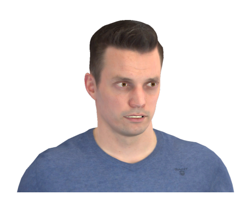
Figure 1: Virtual character addresses observer. Screenshots show, left to right, static face, synthesized expression, and tracked expression. In our study, animation was either in sync with audio or delayed by the animation system's inherent latency.