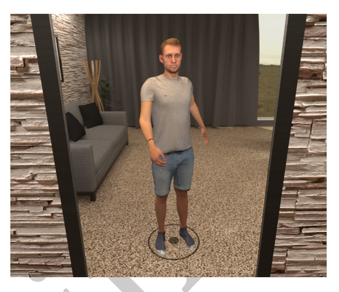
Figure 1: The figure shows a participant's egocentric view while performing the "rotation" task within the virtual environment. The mirror reflects its embodied and personalized avatar.

CHI '22 Extended Abstracts, April 29-May 5, 2022, New Orleans, LA, USA